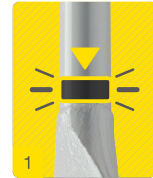
1 Pastille anti-bruit